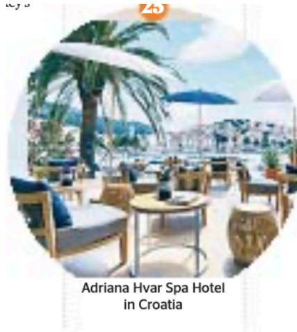
Adriana Hvar Spa Hotel in Croatia

In the slow-paced mountain village of Kalopanagiotis eight cottages have been transformed into pampering lairs for the loved-up, with contemporary furniture, modern art and wood-burning stoves bringing warmth to the exposed stone walls, thick wooden doors and beamed ceilings. Outside are spectacular mountain hikes, or you could repair to the spa with its rasul mud chamber, hydrotherapy pool and excellent massages. You're spoilt for choice at mealtimes with four restaurants, including Kava, a subterranean dining room, for that extra-special occasion. Details Doubles from £80, B&B (casalepanayiotis.com). Fly to Paphos