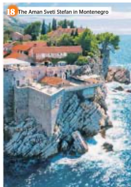
18 The Aman Sveti Stefan in Montenegro