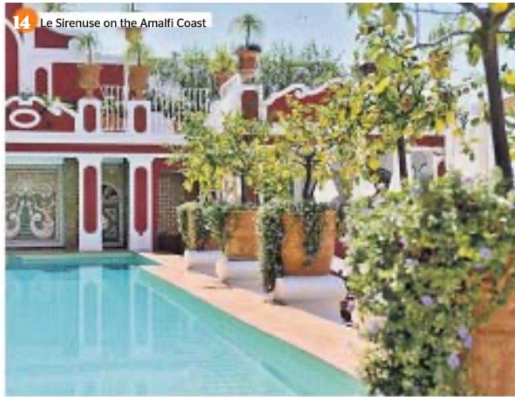
14 Le Sirenuse on the Amalfi Coast