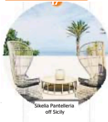
Sikelia Pantelleria off Sicily